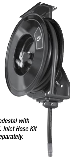
Single pedestal with metal spool. Inlet Hose Kit sold separately.